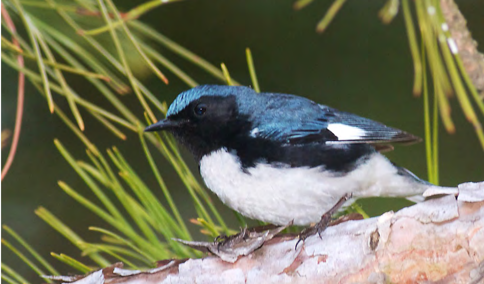
Black-throated Blue Warbler