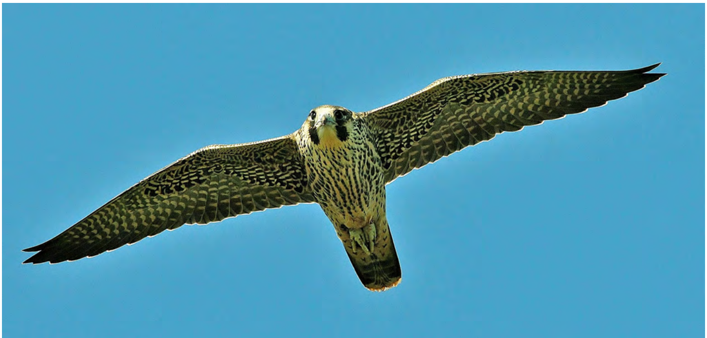
Record daily high of 33 Peregrine Falcons counted at Hawk Ridge on September 29, 2013!