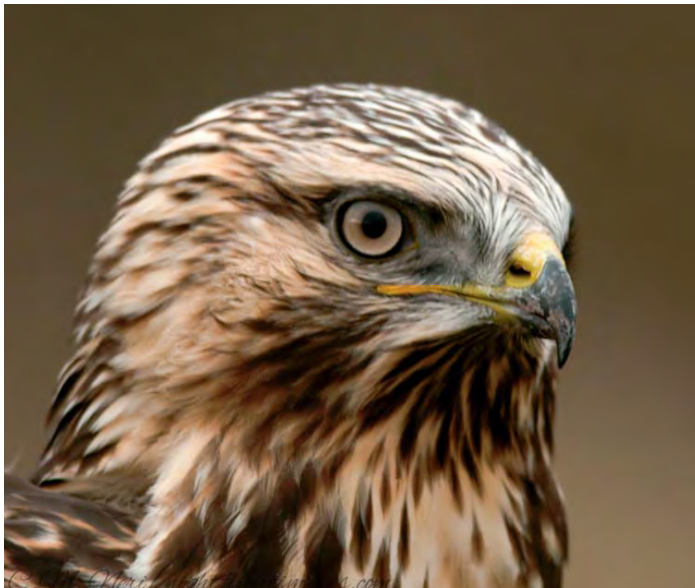
November brought Rough-legged Hawk highlights at Hawk Ridge for both the counters and banders.