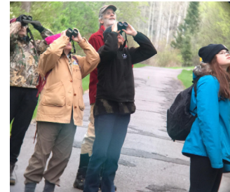
Birding the Mesabi Trail

Cool temps in the 40's and strong 15-30mph east winds didn't stop teams from making the best of the 31 st annual Hawk Ridge Birdathon. In fact, the adverse weather likely helped add exciting new species to our overall list! Seven teams participated in several different categories in this friendly competition throughout the 24-hour period on Saturday May 20 th . We truly thank those that participated and have already pledged. All proceeds go support the bird research and education programs of Hawk Ridge Bird Observatory!