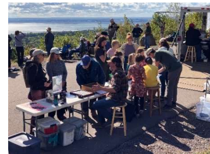
Visitors at Hawk Ridge main overlook