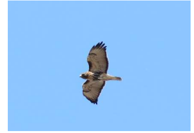
Red-tailed Hawk migrating over Hawk Ridge

During our 2022 Spring and Fall seasons, our skilled and focused counters documented over 84,000 raptors of 18 different species, as well as 163,000+ other migrating birds of 160+ species. Above 10-yr average numbers were counted this fall for Northern Harrier, Broad-winged Hawk, and American Kestrel. A surprise first record of a Swallow-tailed Kite was recorded! In total, over 3.2 million raptors have been counted at Hawk Ridge since the start in 1972.