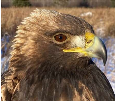
Golden Eagle banded last day of season